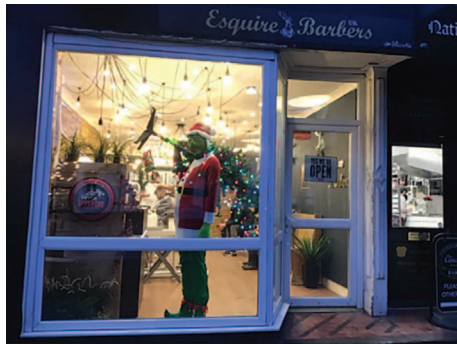
Councils facebook page. The responses were tremendous with residents all voting

As we were unable to ask a group to judge our competition this year due to the restrictions with Covid 19, therefore it was decided to hold a vote on Burscough Town