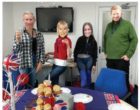
Face for Business