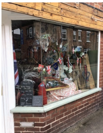
The Three Pence Sea Thrift display