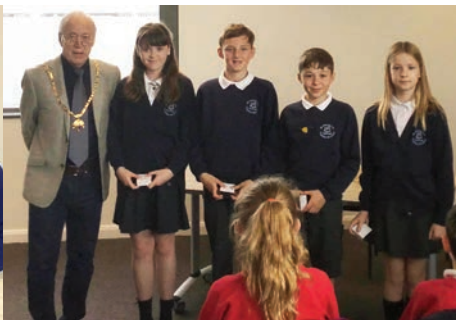
Pupils from St. John's C of E