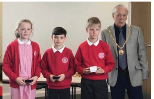
Pupils from Lordsgate Township C of E