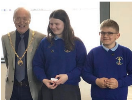
Pupils from St. John's Catholic Primary