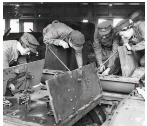
Auxiliary Territorial Service (ATS) at work looking over a Churchill Tank in a REME workshop, Ordnance Depot, Burscough, 10th October 1942.

707 Naval Air Squadron. The squadron formed at HMS Ringtail on 20th February 1945 from 735 squadrons 'B' flight as a radar trails unit. It functioned as the control authority in radar matters including A.S.V. (Airborne to Surface Vessel) and A.I. (Airborne Intercept) systems and the airborne radar training of flying personnel. Equipped initially with Fairey Swordfish Mk's II and III, Fairey Barracuda Mk's II and III, Grumman Avenger Mk III and later supplemented with radar equipped Avro Anson Mk I. The squadron moved on to Gosport in late August, where it disbanded on 1st October.