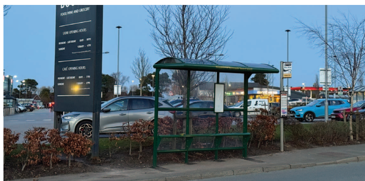
New bus stop shelter near Booths, supplied by Burscough Town Council.

Public Transport is a great way to get from A to B and to do your bit for the environment. Every bus journey reduces the number of cars, vans and motorbikes on the road, which means the air we breathe is cleaner. There are numerous buses which pass through the village, as well as two train stations.