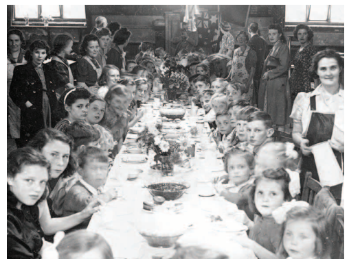
VE Day Party at St. John's C of E Primary School, 1945.

The Auxiliary Territorial Service (ATS) was the women's branch of the British Army during the Second World War. It was formed on 9th September 1938, initially as a women's voluntary service and existed until 1st February 1949, when it was merged into the Women's Royal Army Corps.