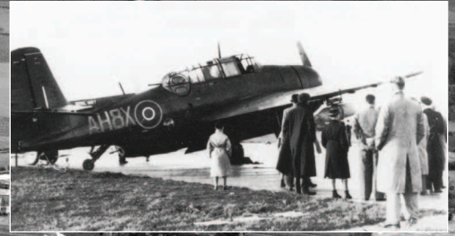
Grumman Avenger of 707 Naval Air Squadron being inspected by members of the public shortly after VJ Day, HMS Ringtail, RNAS Burscough 1945.

Between 1943 - 1946 the population of Burscough increased by thousands as the Fleet Air Arm built a Naval Air Station on the outskirts of the village. For three eventful years, 650 acres of former farmland hosted every type of naval aircraft. During the summer of 1942, the Fleet Air Arm forecast that it was due to expand from 2,665 operational aircraft to a total of 6,350 by the end of 1943. Most pilots and observer training had been conducted on a piecemeal basis by the RAF School, but the Admiralty had always considered this to be a stop gap rather than a permanent program. Air Ministry bosses were persuaded to give up a number of airfields to the Royal Naval Air Service and build new ones, HMS Ringtail being one of these.