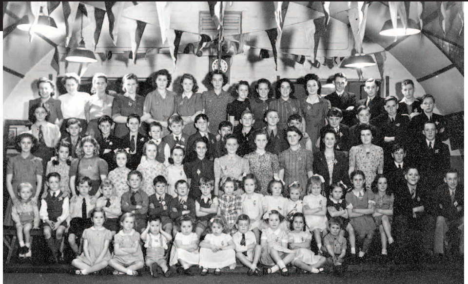
VE Day celebrations held at Lordsgate School in October 1945. The school was at this time housed in Nissen Huts off Liverpool Road South after the original school had to be demolished to make way for the Royal Naval Air Station, HMS Ringtail.